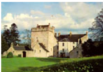
Kilravock Castle near Nairn