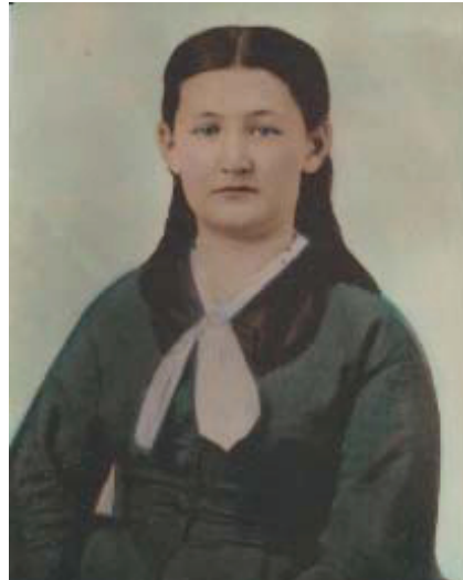
DESCENDANT OF GRANVILLE COUNTY, NORTH CAROLINA ROSE FAMILY.