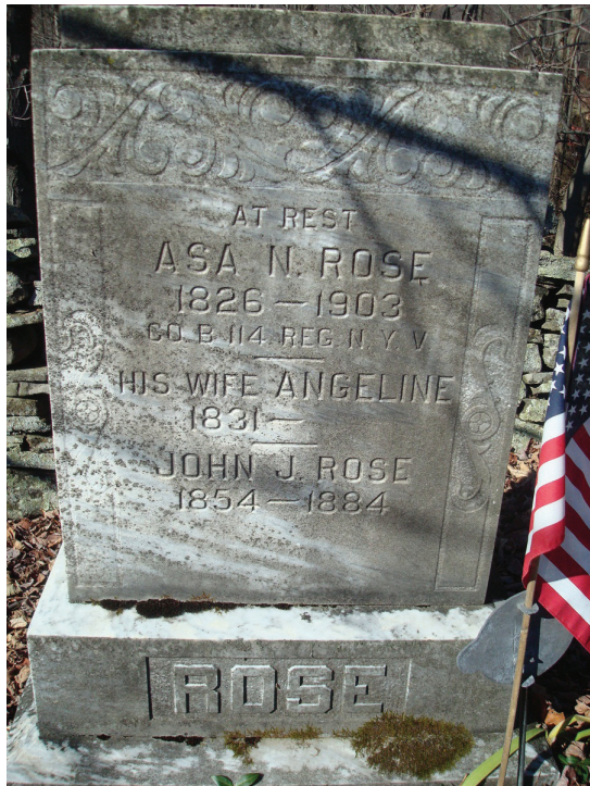
Little York Cemetery, Preston twp., Wayne County, New York.

Other miscellaneous records in the file.