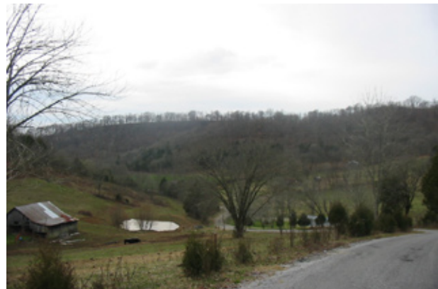
A beautiful vantage point looking down the hill into the hollow.